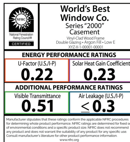
EXAMPLE OF NFRC LABEL

Note that in Europe, the NFRC is not the norm since different testing is done by different organizations. While the physics are the same, the math is different, and the results are reported in different ways. Therefore, it is very difficult to do an “apples to apples” comparison between European and US made windows purely on the basis of their respective testing reports. The best way to compare performance for projects in North America is to seek NFRC information to ensure the same testing procedures have been used.